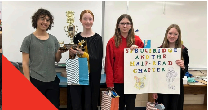
Estevan Area Literacy Group Battle of the Books

My life has changed for the better after having been in the Women's Empowerment class with Envision. It's taught me so many things about living in the moment, not living in the past. The facilitators made me feel accepted and part of the group instantly. The ladies who were a part of the group with me connected so well. This was truly meant for me. We all need a boost and to feel empowered by others!" Anonymous