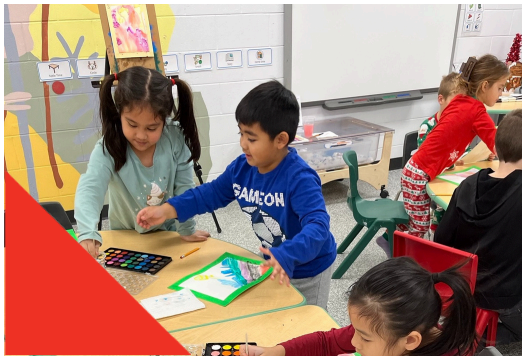
Estevan Early Years Family Resource Centre